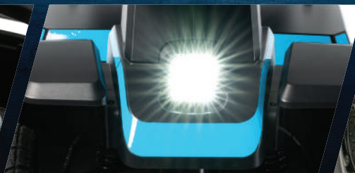
Enhanced LED headlight