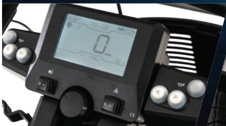
LCD digital display